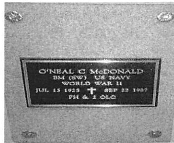
BRONZE NICHE (Z)

This niche marker is 8-1/2 inches long, 5-1/2 inches wide, with 7/16 inch rise. Weight is approximately 3 pounds; mounting bolts and washers are furnished with the marker. Used for columbarium or mausoleum interment. Also provided to supplement a privately-purchased headstone or marker for eligible Veterans who died on or after November 1, 1990 and are buried in a private cemetery.