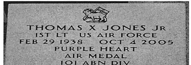
SMALL FLAT GRANITE (L)

This grave marker is 18 inches long, 12 inches wide, and 3 inches thick. Weight is approximately 70 pounds. Variations may occur in stone color.