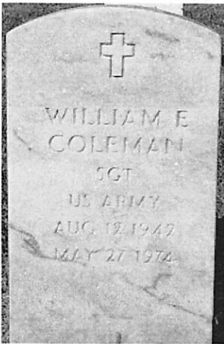
UPRIGHT HEADSTONE WHITE MARBLE (U) OR LIGHT GRAY GRANITE (V)

This headstone is 42 inches long, 13 inches wide and 4 inches thick. Weight is approximately 230 pounds. Variations may occur in stone color, and the marble may contain light to moderate veining.