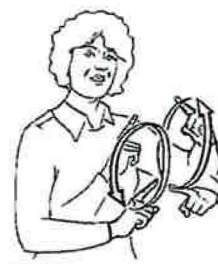
SIGN, SIGN LANGUAGE